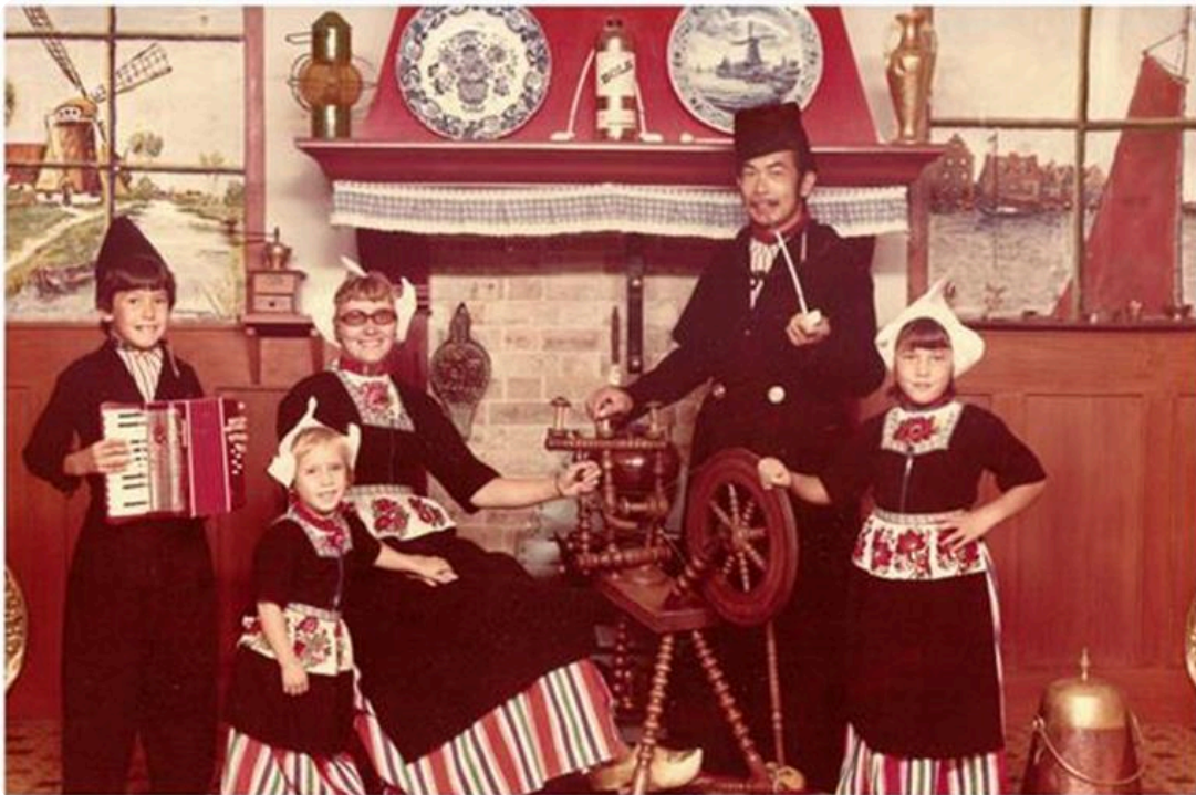
Family trip to Holland