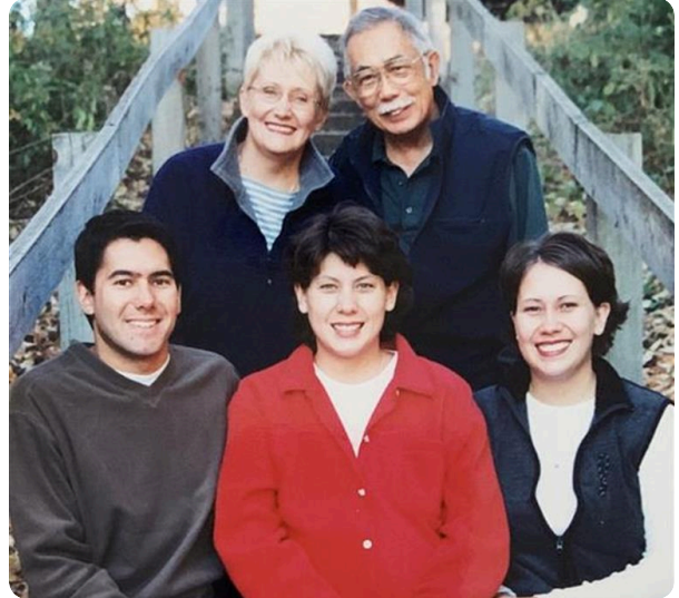
Family photo from Tartan Park